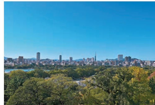
Clear view of Fukuoka Tower from the castle tower base