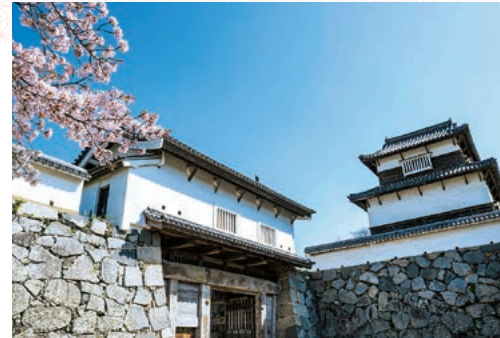
Shimonohashi Gomon Gate (left), Den Shiomi Yagura (right)

Designated a National Historic Site, the stone walls and footprint of the castle here still remain among the ruins. In spring, the area with the Shiomi Yagura and Shimonohashi Gomon Gate attracts a multitude of visitors to view the cherry blossoms in full bloom.